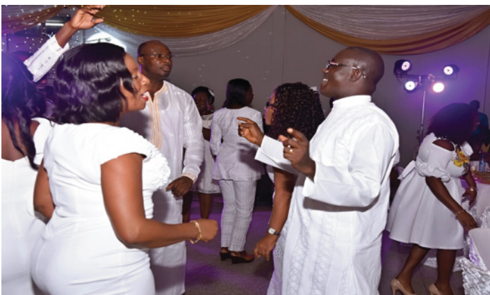
More dance moves