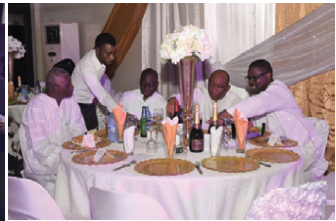
Former Board Members and the Director General