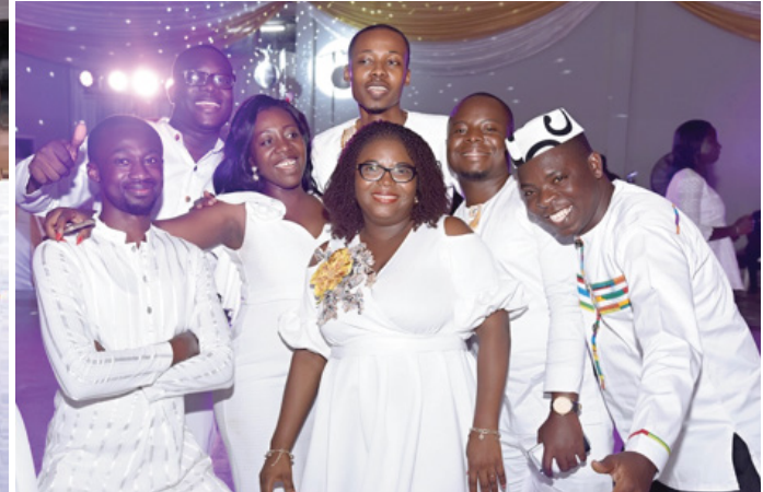
A section of the staff at the function