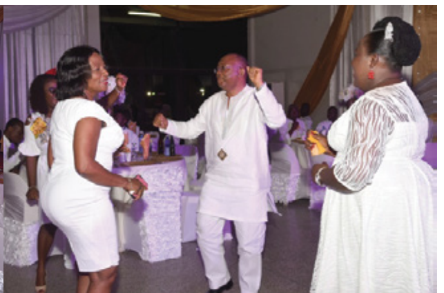
More dance moves